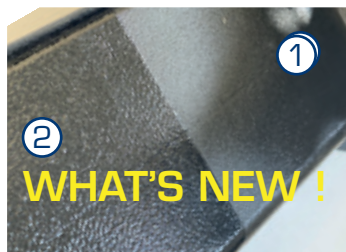
POWDER COATING PAINT (2) ADDED TO KTL PLUS (1). NO RUST AND NO SALT STAINS.