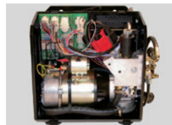
LOW NOISE POWER UNIT & NO ELECTRONICS = EASY MAINTENANCE