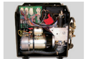
LOW NOISE POWER UNIT & NO ELECTRONICS = EASY MAINTENANCE