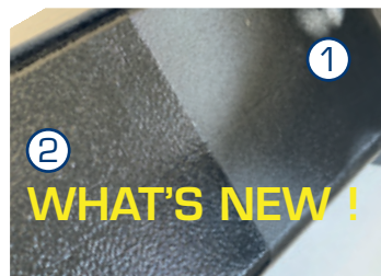
POWDER COATING PAINT (2) ADDED TO KTL PLUS (1). NO RUST AND NO SALT STAINS.