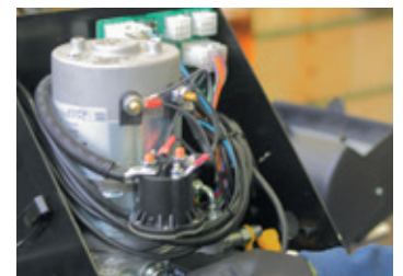
LOW NOISE POWER UNIT & NO ELECTRONICS = EASY MAINTENANCE