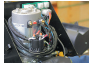
LOW NOISE POWER UNIT & NO ELECTRONICS = EASY MAINTENANCE