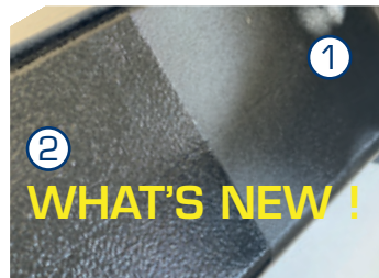
POWDER COATING PAINT (2) ADDED TO KTL PLUS (1). NO RUST AND NO SALT STAINS.