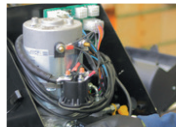
LOW NOISE POWER UNIT & NO ELECTRONICS = EASY MAINTENANCE